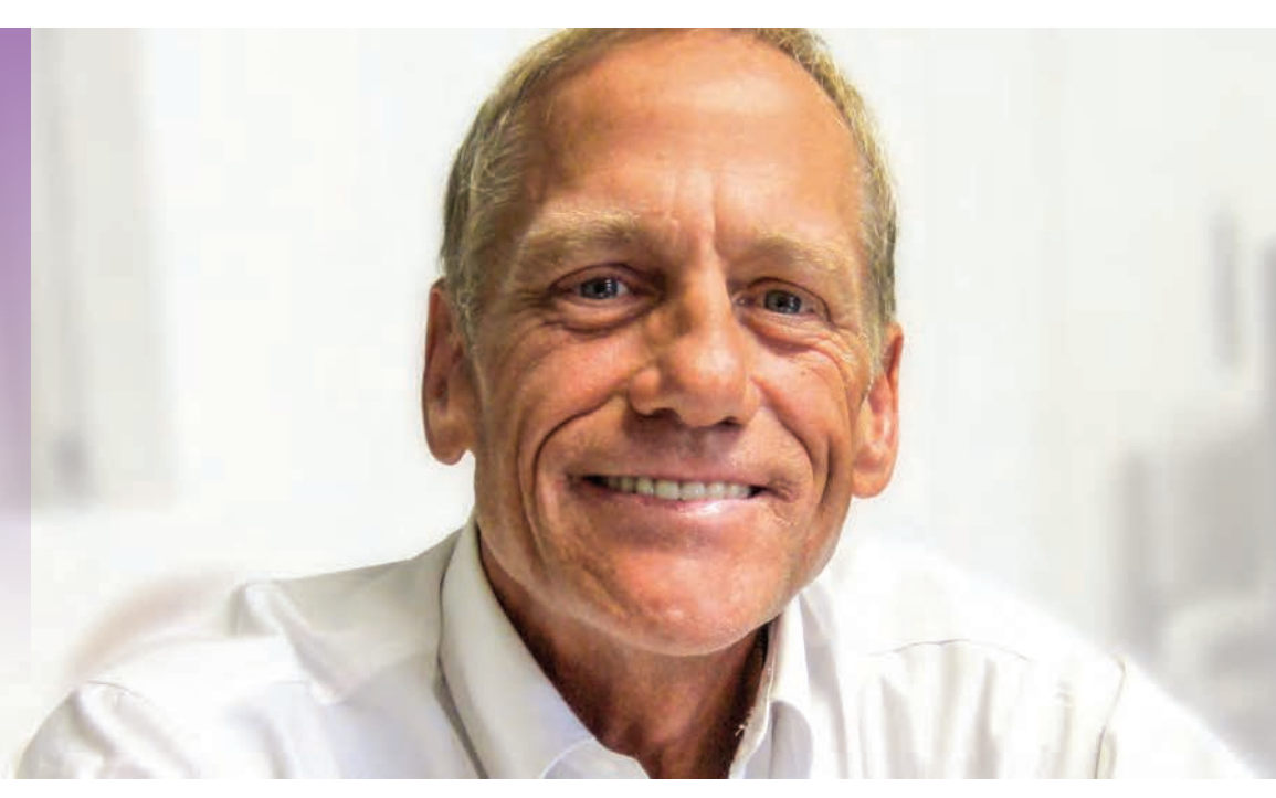
Thank you for being there for me. I'll always remember your kindness.

"Lies kept me in bondage . . . but God's truth is setting me free."